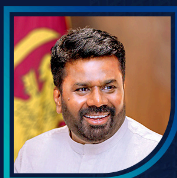
H E ANURA KUMARA DISSANAYAKE

President of the Democratic Socialist Republic of Sri Lanka