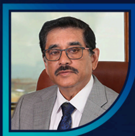
DR. P NANDALAL WEERASINGHE Governor - Central Bank of Sri Lanka

POLICY FRAMEWORK FOR ACCELERATED ECONOMIC GROWTH