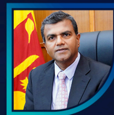
DR. HARSHANA SURIYAPPERUMA Deputy Minister - Finance & Planning Sri Lanka